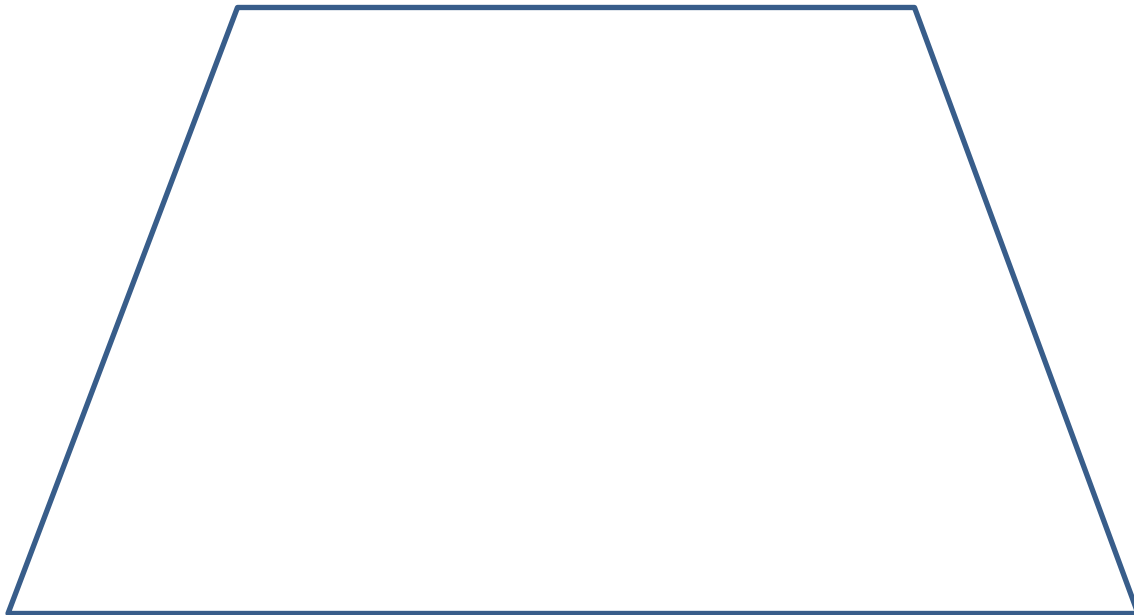
Front of Stage

The stage provided will be a curtain set. On the stage diagram below, we have indicated the entrances and position of furniture for our play: